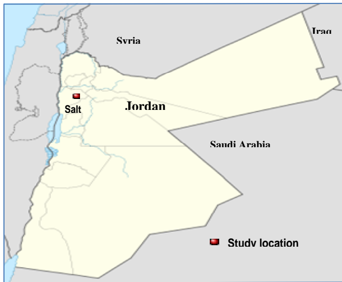
Figure.1 Location Map of the Study Area

A very high significant amounts of available “K” was measured at the beginning of the treatments (Table 3), then it starts to decrease during the decomposition process, but it remains very high at the end of the decomposition period with 3640 ppm.