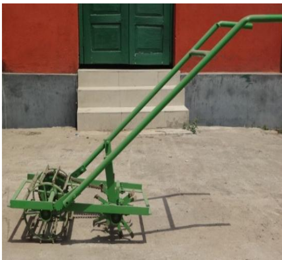
Fig.1 Side view of Rotary Weeder