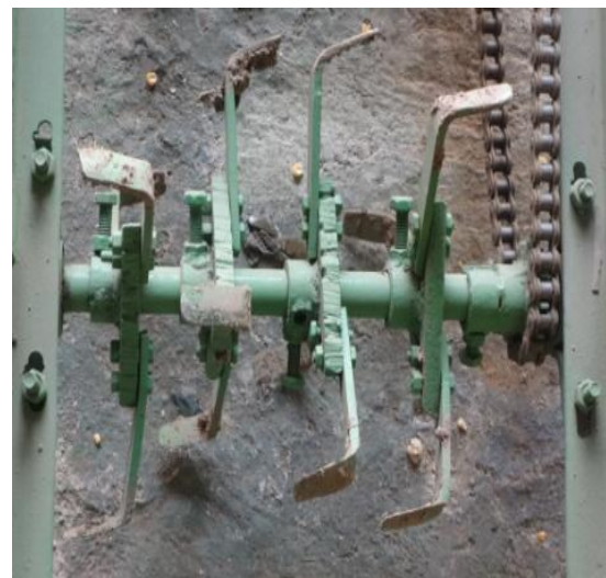
Fig.2 Top view Tines of Rotary Weeder