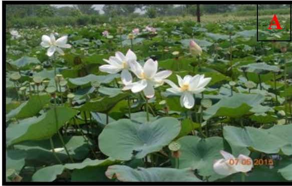
Fig.1 Lotus Flower (A), Field View(B),Mature Field(C), Harvesting of Lotus Rhizome (D), Washing and Grading of Product (E), Bundling of Products(F), Transportation(G), Marketing of product(H)