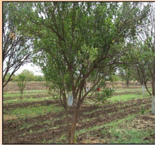
Module IV Before treatment