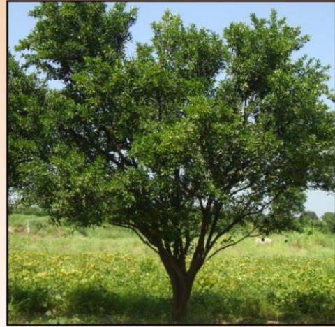
Module IV After treatment