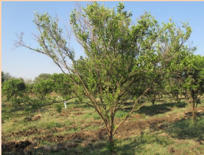
Yellowing of leaves and drying of branches due to root rot