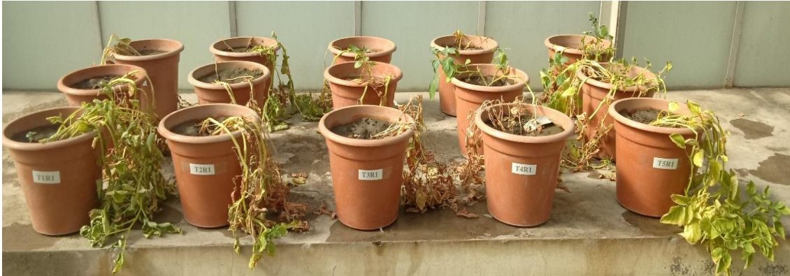
Figure.2 Effect of different inoculum levels (viz. T1- 10 juvenile, T2- 100 juvenile, T3- 1000 juvenile, T4- 10000 juvenile of PCN per pot and T5 is uninoculated control) of PCN on plant growth

Differential environmental conditions, duration of crop growth cycle and differences in the susceptibility of cultivars (use of resistant crop) may reflect differences in the reproduction rates of the nematode. Our results of present study revealed that, the total population (Pf) was highest in the plants inoculated with 10,000 J2/plant and lowest in those inoculated with 10 Juveniles per pot Table- 2. A significant linear relationship was found between the initial (Pi) and final population (Pf) of Globodera rostochiensis . Whereas, reproduction factor was significantly reduced with an increase in inoculum levels. This decline trend of reproduction factor suggested, a density dependent phenomenon.