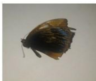
Common evening brown