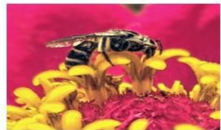
Giant honey bee