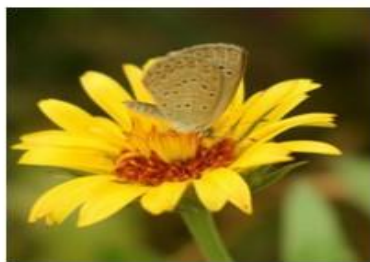
Lesser grass blue