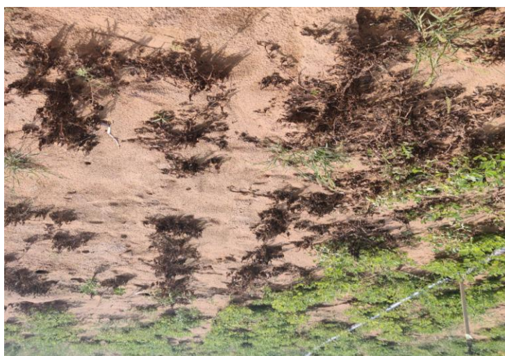
Fig.1 View of groundnut collar rot infected field