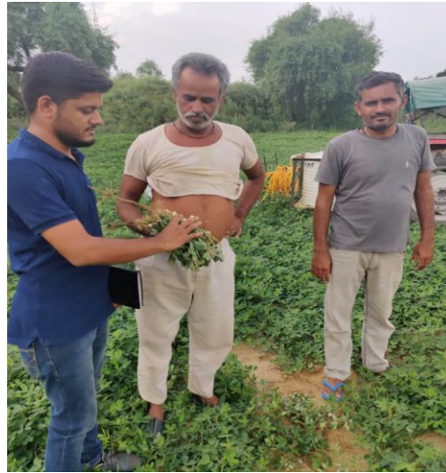
Fig.3 Incidence of groundnut collar rot disease, Jodhpur, Rajasthan