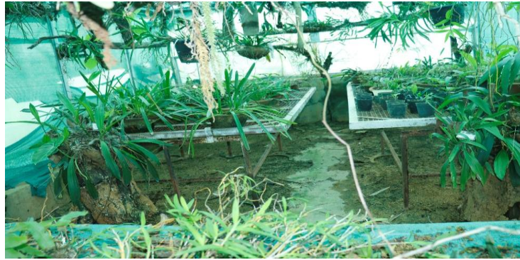
Plate.2 Wild orchid species used to study the flower characters