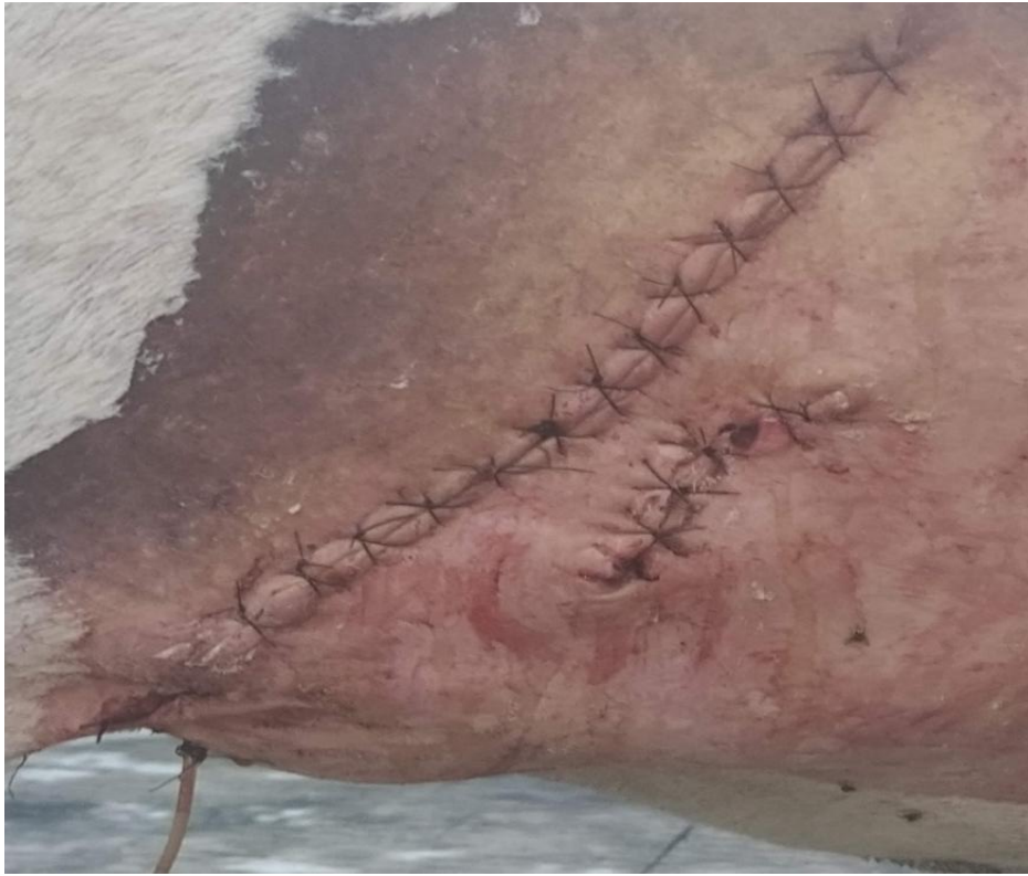
Figure.3 Bullock immediately after surgery