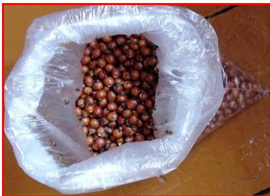
Figure.3 Insecticide in normal packaging