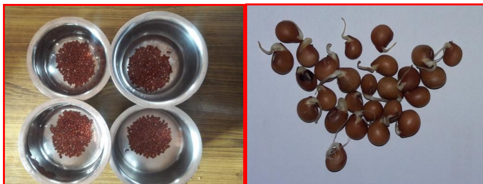
Figure.6 Cooking quality and Sensory evaluation of pigeon pea