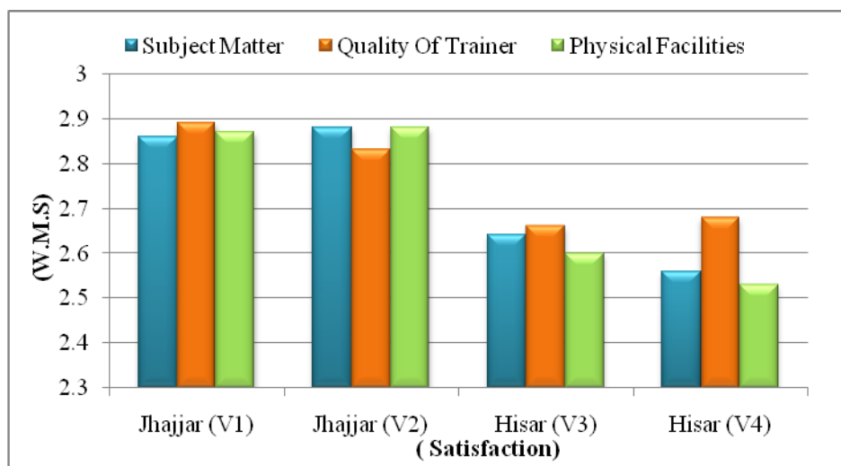
Fig.1 Overall satisfaction of women towards trainings