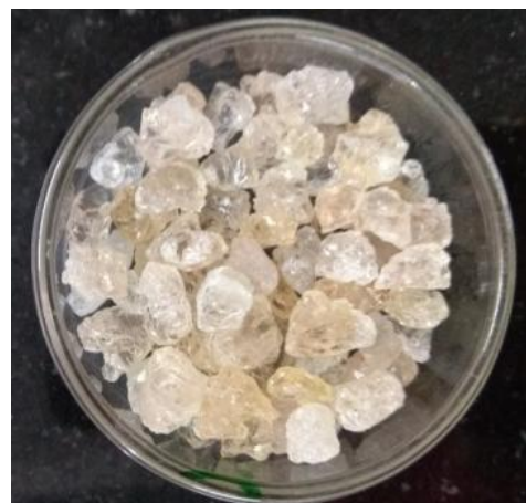
Fig.5 Anogiessus latifolia