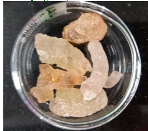
Fig. 4. Acacia senegal