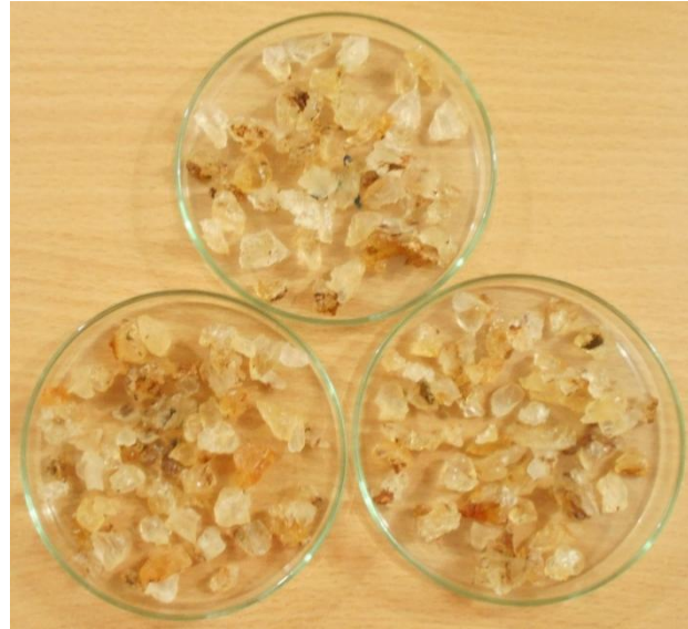
Fig. 2. Karaya gum (Sterculia urens Roxb.)