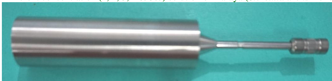
Fig. 7. Spindle number 61