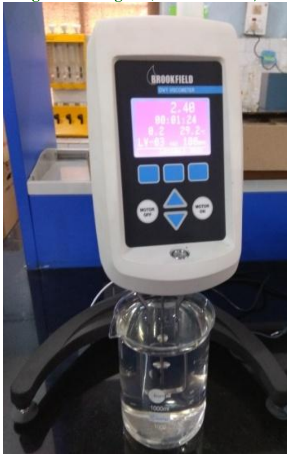
Fig.3 Brookfield Viscometer (DV-E)