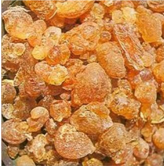
Fig. 1. Babool gum (Acacia nelotica)