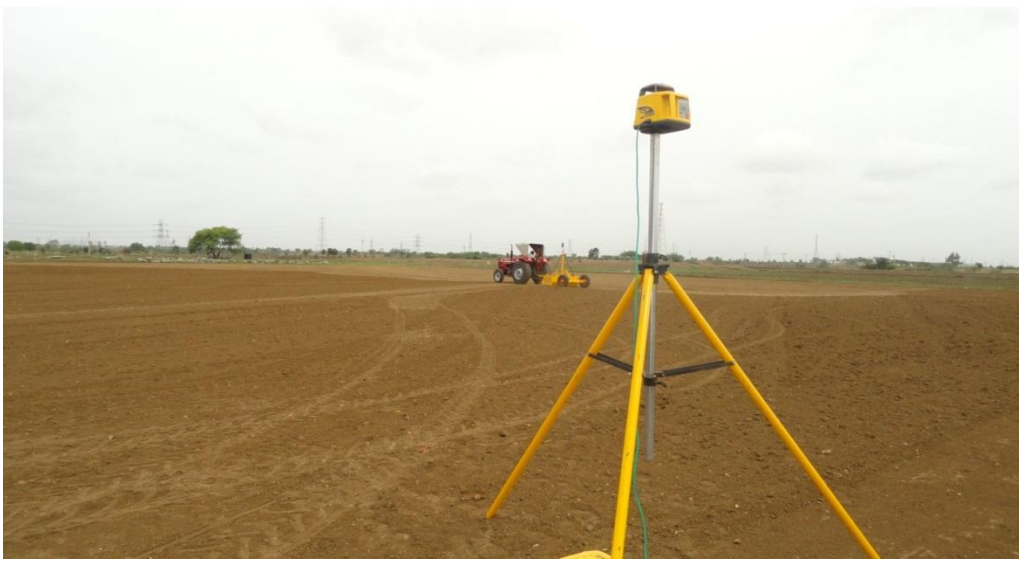
Fig.1 Operational view of the laser land leveling