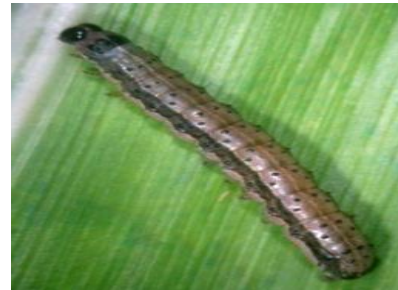
Fig.8 VI instar larva