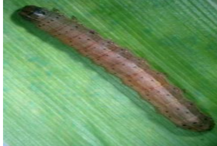
Fig.7 V instar larva