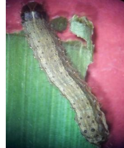
Fig.6 IV instar larva