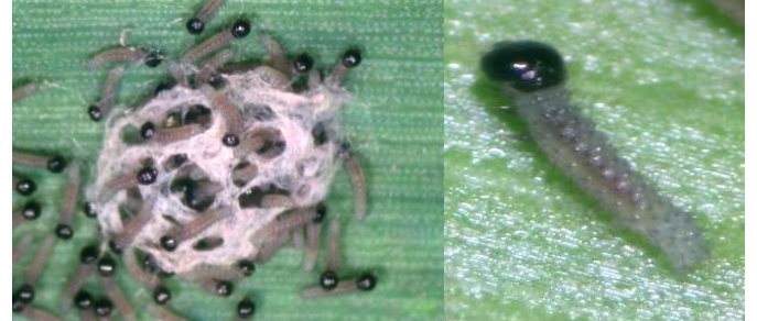
Fig.3 I instar larvae