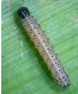
Fig.4 II instar larva