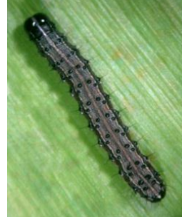
Fig.5 III instar larva