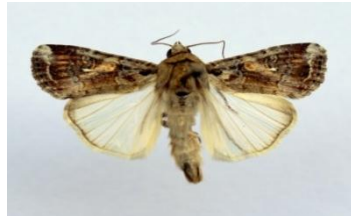
Fig.10 Male moth