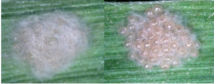
Fig.2 Egg mass of S. frugiperda