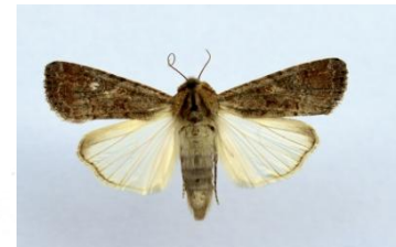
Fig.11 Female moth