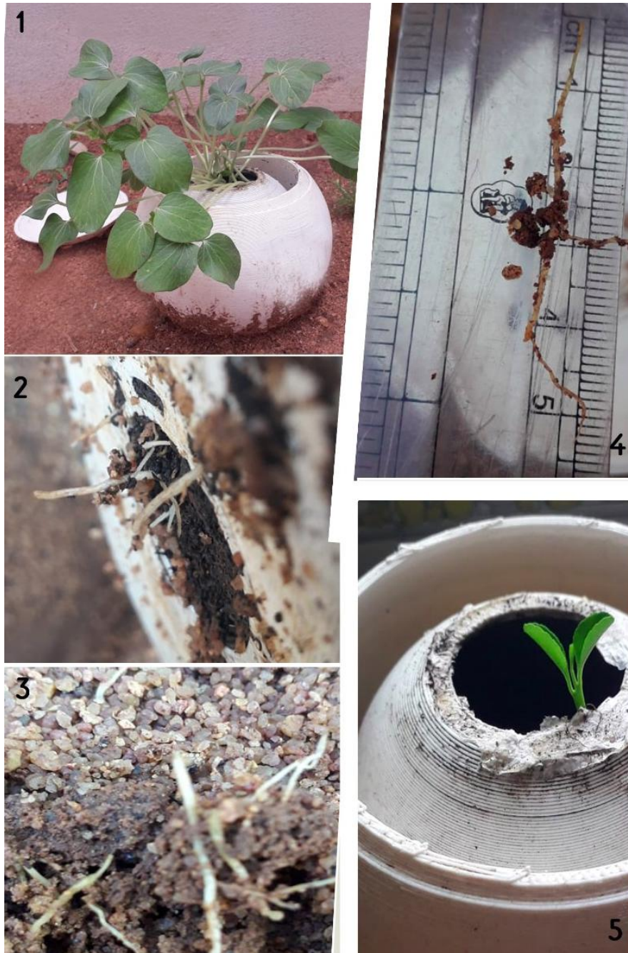
Figure.1 Robust growth of ladies finger seeds in seed wombs, Fig.2-Serrated roots emerging out of seed womb and piercing the soil Fig.3&4-The cluster of roots in the soil and length of the roots in the soil Fig5-Growth of hardy tamarind seeds in seed wombs. Duration -20 days

Where rates of tropical deforestation are high and where formerly forested landscapes are converted into mosaics of small patches of forest remnants, forest restoration has become an increasingly important tool for species preservation and for maintaining the diversity