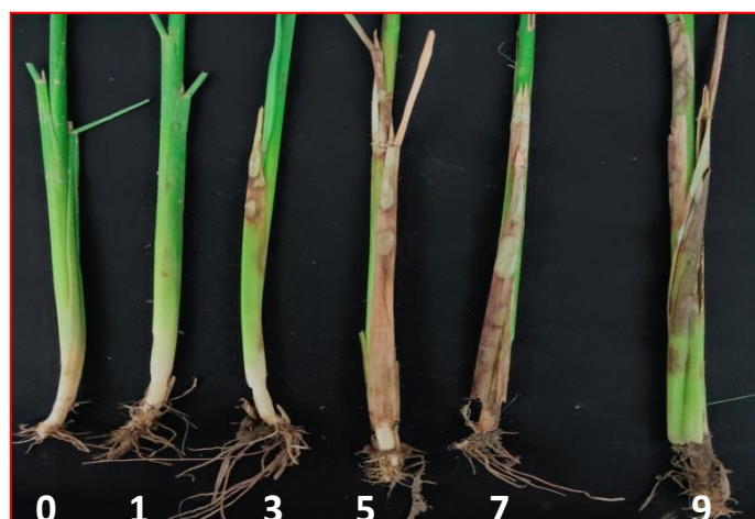
Fig.1 Rice sheath blight grade chart