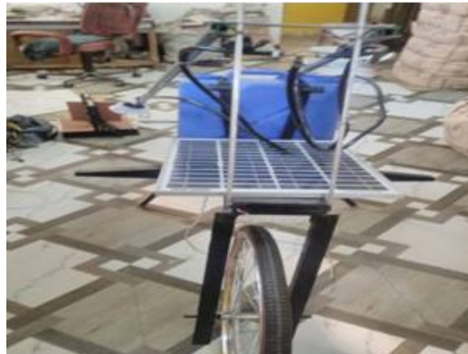
Fig.7 High clearance bullock drawn solar sprayer