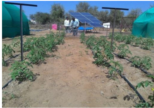
Fig.5 Portable solar powered sprayer