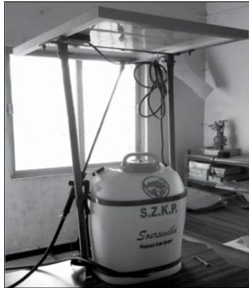
Fig.4 Field evaluation of trolley based solar sprayer