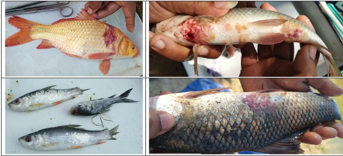
Fig.2 Fishes infected with A. hydrophila