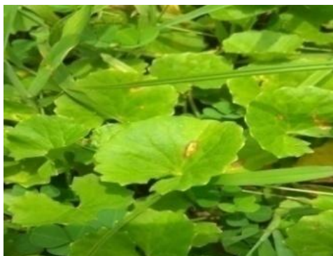
Plate 2. Leaf spot of thankuni