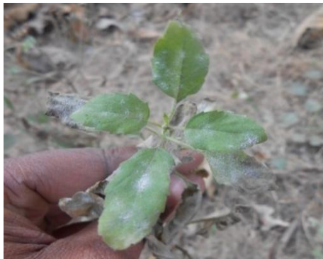
Plate 5. Powdery mildew of holi basil