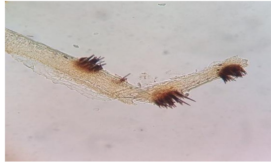
C.O.: Colletotrichum dematium