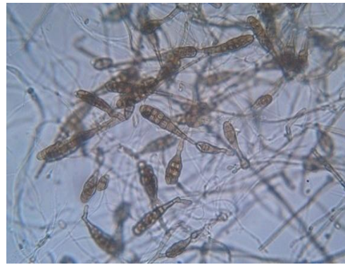
C.O.: Alternaria porri