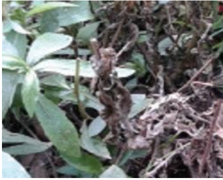
Plate 6. White rot of starthorn