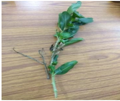
Plate 3. Leaf spot of periwinkle