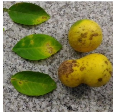
Plate 8. Leaf and fruit canker of citrus