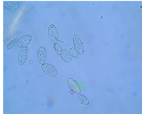
C.O.: Erysiphe biocellata