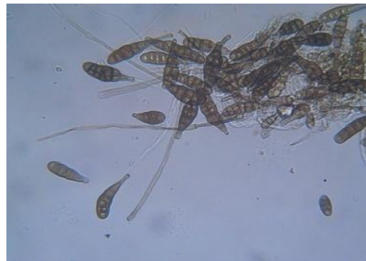
C.O.: Alternaria alternata