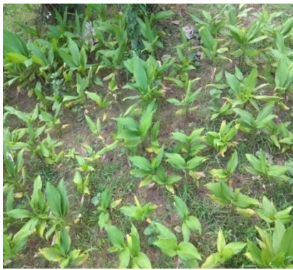
Plate 7. Leaf blotch of turmeric