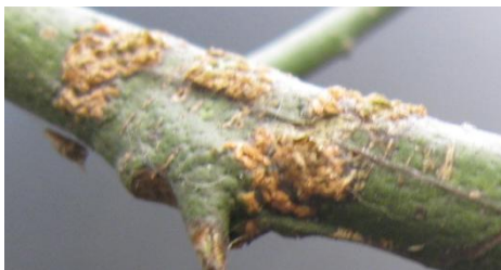
Plate 9. Stem canker of citrus