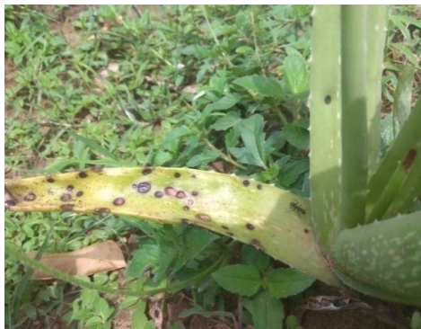
Plate 1. Leaf spot of Aloe vera