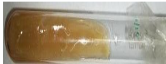
Plate 10. Growth of Xac in NA medium

White rot of Kulekhara/ Starthorn ( Hygrophila auriculata (Schum.) Heyne., Family: Acanthaceae)