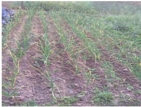
Plate 4. Alternaria blight of garlic