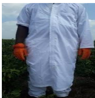
Fig.1 Covered and uncovered areas on the forearm of applicator