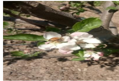
Apis mellifera L.