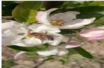
Apis cerana F.