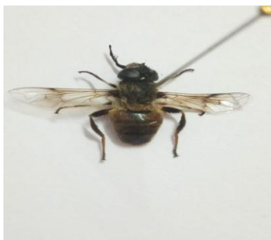
Eristalis tenax L.