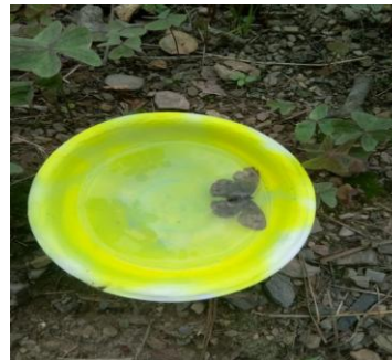
Insects caught in fluorescent trap