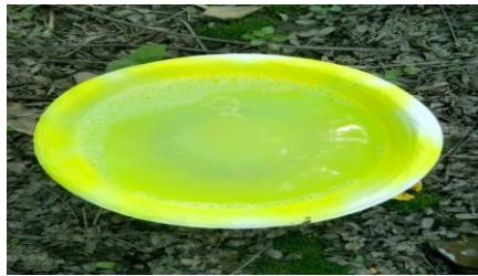
Fig.1 Use of fluorescent pan trap for passive sampling