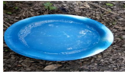
Fluorescent coloured traps (Yellow and blue)