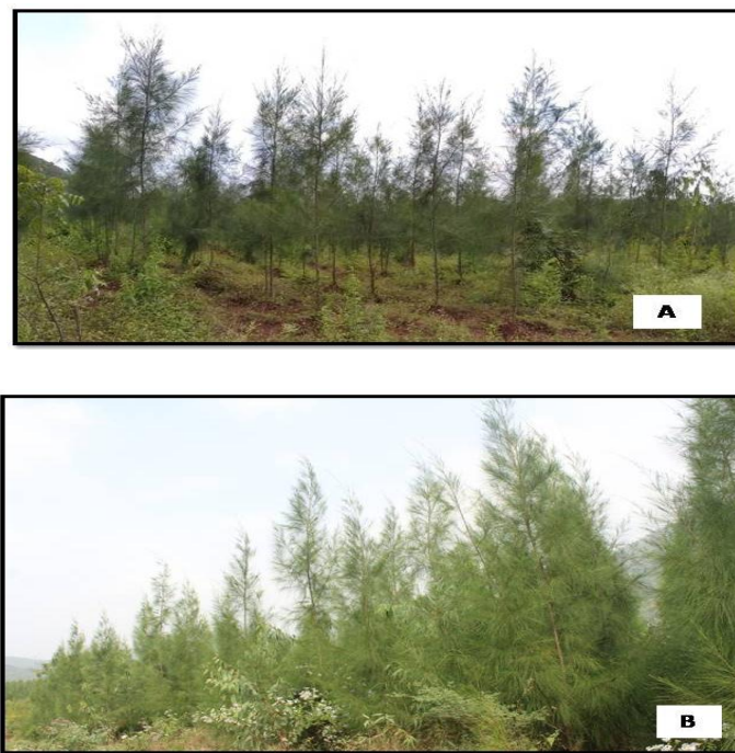
Fig.1 Overview of experimental plots at different location