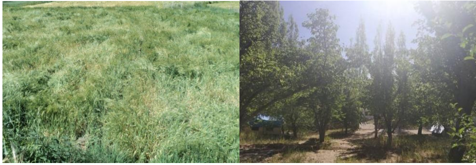
Plate.2 Agrisilviculture land use (wheat+poplar) Hortisilvipasture apricot+salix+alfalfa)