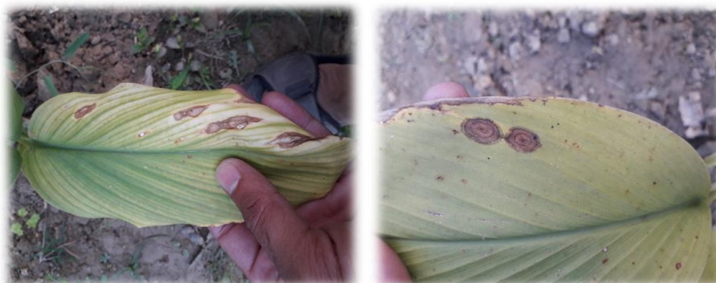
Fig.4 Scoring of disease intensity in Turmeric