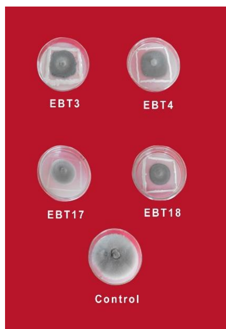
Fig.1 Antagonistic activity of different isolates of endophytic bacteria against Alternaria solani