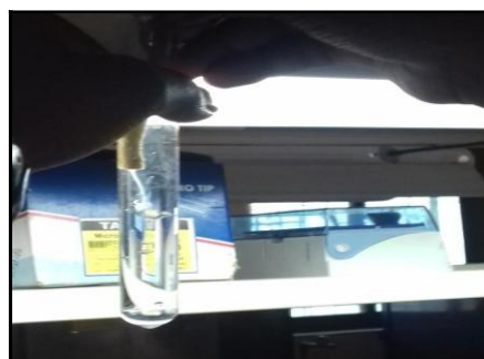
Bacterial oozing from cut end of potato stem