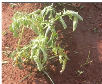
Bacterial wilted potato plant