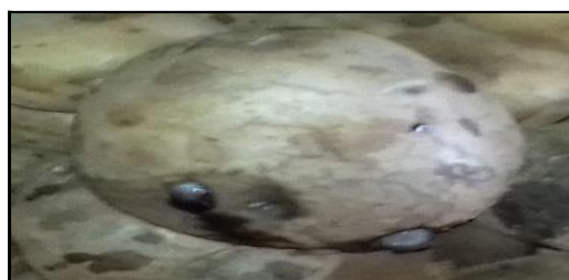
Bacterial oozing from infected tuber eye