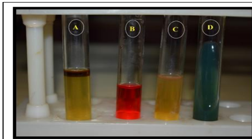
Figure: IMViC biochemical test for E.coli . Where A indicate Indole test, B indicate Methyl red, C indicate Voges-Proskauer test and D indicate Citrate utilization test.