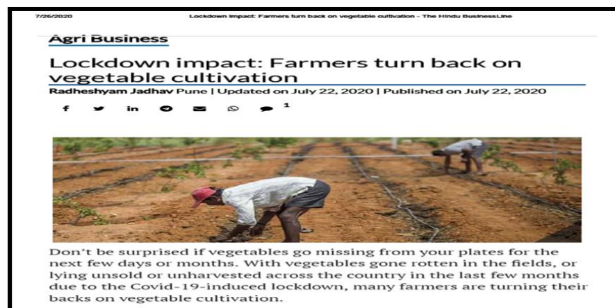
Plate.1 Article published in The Hindu Business Line regarding ‘Lockdown Impact: Farmers turn back on vegetable cultivation’