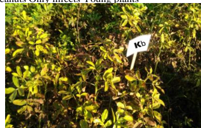
Kontrol hanya memakai Bioslurry