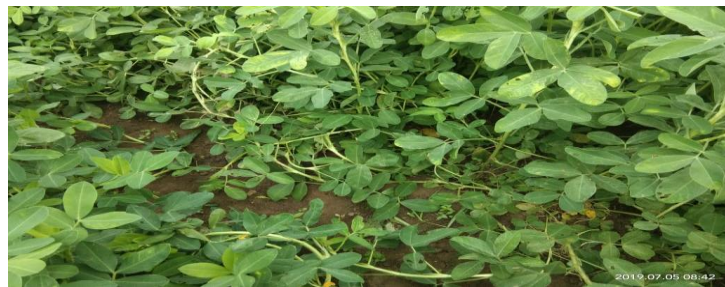
Observing Mottle Virus in Peanuts Only infects Young plants