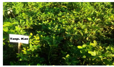
T. asperelum with Vermicompost carrier