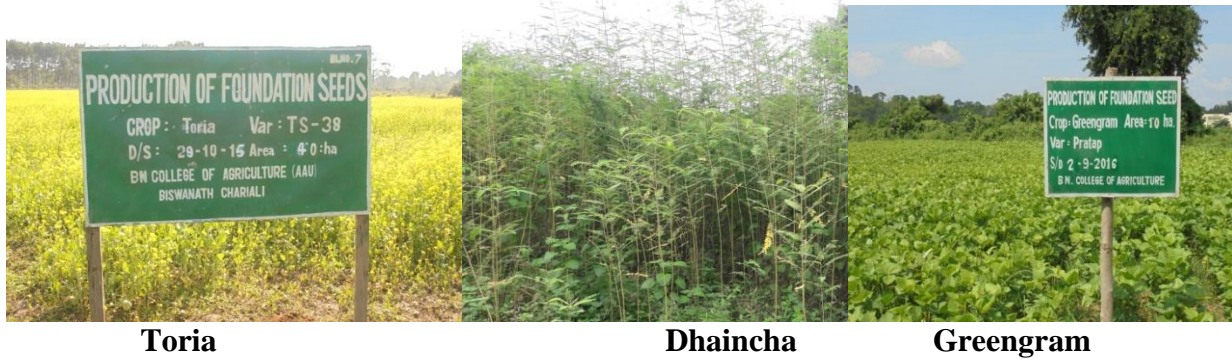
Fig.3A Crop sequence Toria—Dhaincha--Greengram