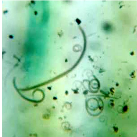
Fig.1 Microscopic view of different plant parasitic nematodes recorded in the field