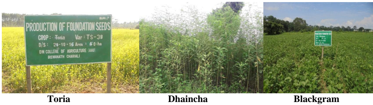
Fig.3B Crop sequence Toria---Dhaincha—Blackgram