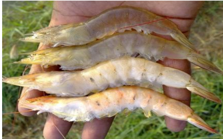
Figure.3 Dead shrimp samples due to prevalence of RMS, indicating continuous mortality There is no correlation to the known water quality parameters like pH, Ammonia nitrogen, Nitrite nitrogen, Hydrogen sulphide low dissolved oxygen concentration and plankton