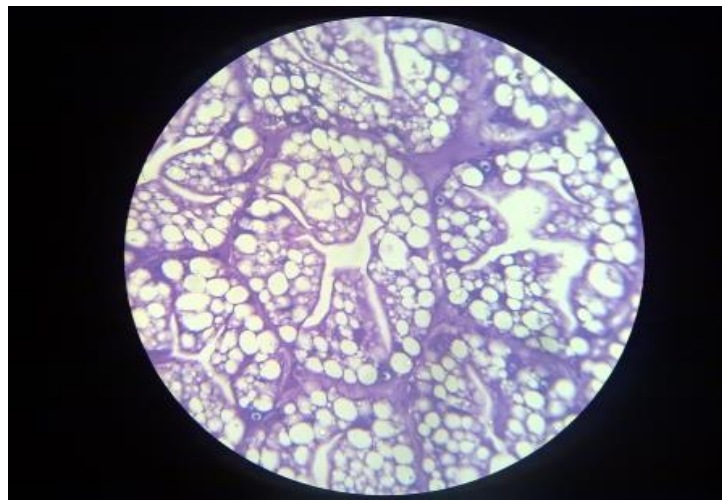
Figure.4 Histology of Hepatopancreas of RMS shrimps with more B and R Cells