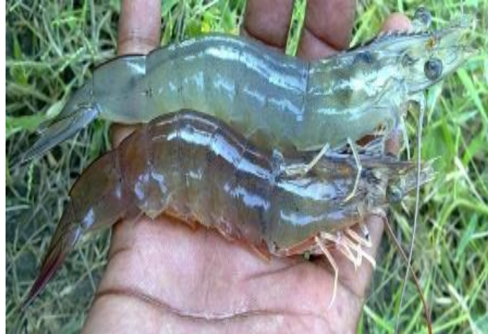
Figure.2 Showing upper normal and lower diseased shrimp