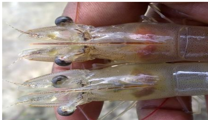
Figure.1 Reddish yellow Hepatopancreas during early stage of RMS

In the early stages of disease Litopenaeus vannamei , apparently started showing gross signs, which were characterized by the antennae cut and Uropods turned normal to red in color. Later on Hepatopancreas turns reddish yellow (Figure1) and finally entire body turns dark red in color (Figure 2). Continuous internal mortality is noticed throughout the day (Figure 3). The dead shrimps are settled at the bottom of the tank and will not come to sides or surface. Farmers will come to know about this only when dead and cannibalized shrimp come to check tray. The mortality is noticed irrespective of seed source. The occurrence of mortality is directly proportional to stocking density. Higher the stocking density early the mortality sets in. Mortality rate is relatively more in low saline ponds. White or yellow fecal matter is noticed in the gut. Mortality noticed only during inter-moult stage. Very poor survival and high feed conversion ratios were reported at the time of harvest.