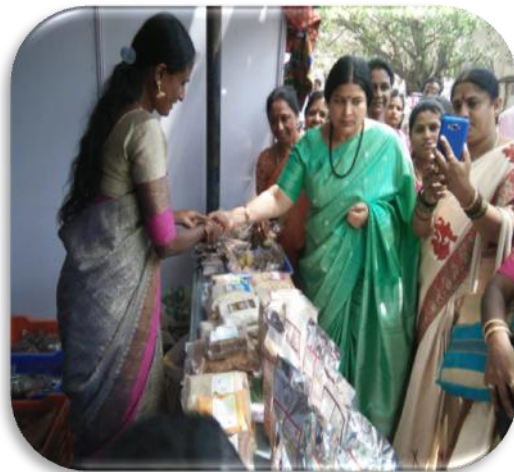
Display and sale of Value Added products at different places like Exhibitions and Melas