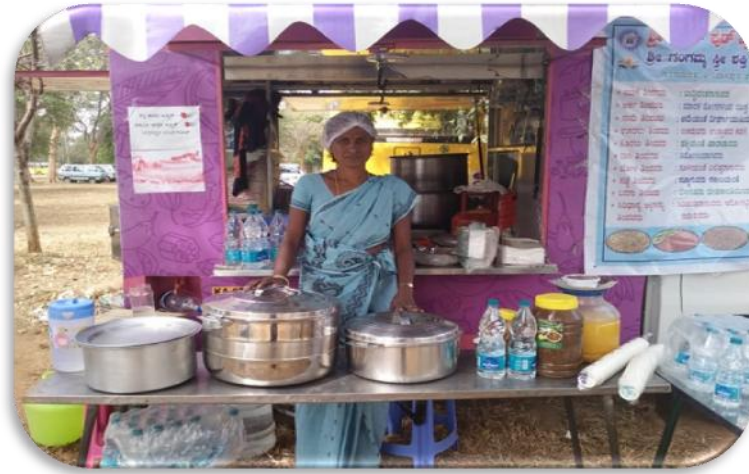
Savi Ruchi Canteen at DC Office, Kolar