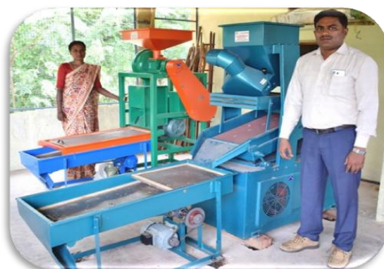
Minor Millers processing unit have established at Guddamanatta