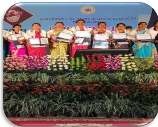
District level Award received at Minor millets and Best Farmers Award by UAS,GKVK, Bangalore flower show Organized by Department of Horticulture