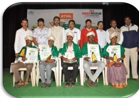
Super Star Raitha award from Vijay Karnataka