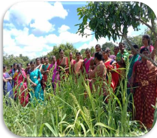
Training programmes has conducted at Gundamanntha, Srinivasapura TQ