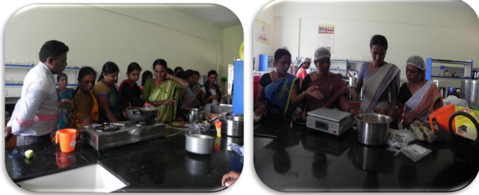
Vocational Training programme conducted at ICAR-KVK, Kolar