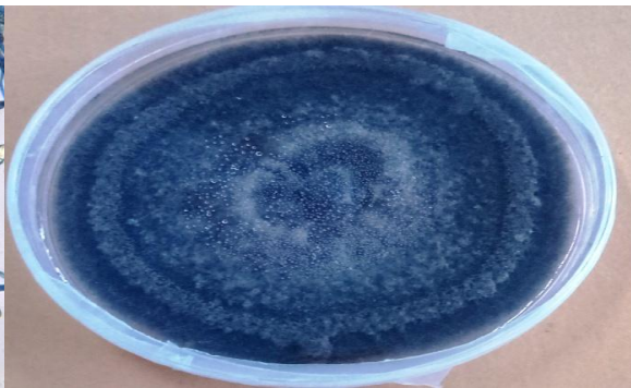
Fig 6: Pathogen Alternaria Brassicae