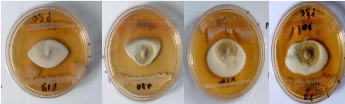
Fig1: B9 and B10