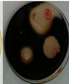
Fig9: Starch hydrolysis