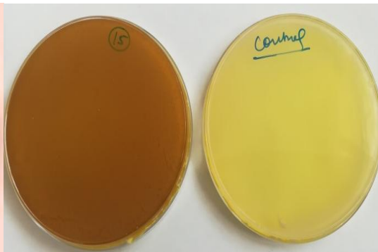
Fig 8: HCN Production and Control