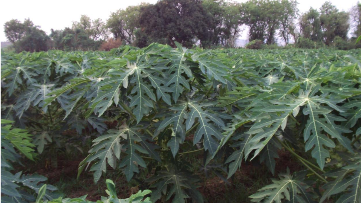
Fig.2 PRSV infected papaya crop cv. Red Lady in 2017-18 season