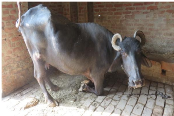
Fig.1 Lameness and poor body condition