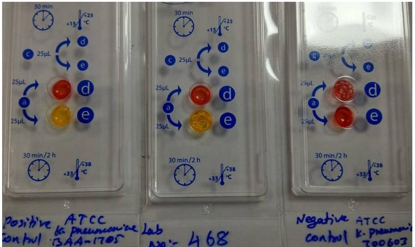
Figure.2 Modified carbapenemase inactivation method