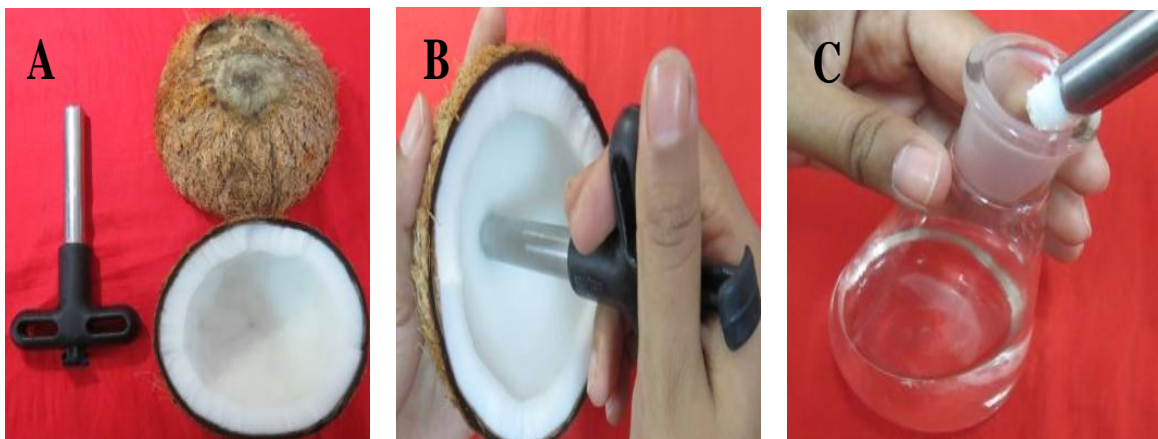
Fig. 1. Isolation of embryo along with endosperm from the seed nut

A significant difference was observed among the treatments with respect to shoot regeneration (Table 2). Shoot regeneration was recorded at 120 days after inoculation and the highest percentage was recorded in the treatment T 2 (Y3 basal + 150 µM TDZ) i.e. , 72.73 per cent. Treatment T 1 (Y3 basal) recorded 63.64 per cent of shoot regeneration which was followed by T 3 (Y3 basal + 300 µM TDZ) with 36.36 per cent. Lowest shoot regeneration was observed in T 4 (Y3 basal + 450 µM TDZ) i.e. , 18.18 per cent. TDZ has a significant effect on shoot regeneration and complete shoot development. These findings are in agreement with Huetteman and Preece (1993) where the effect of TDZ on woody species was well described as TDZ could facilitate micropropagation of many recalcitrant woody species. Maximum shoot regeneration from the embryogenic calli of sugarcane was achieved when MS media supplemented with TDZ (Gallo-Meagher et al. , 2000). Lower risk of genetic manipulation in direct organogenesis compared to somatic embryogenesis would be a major advantage in plant regeneration.