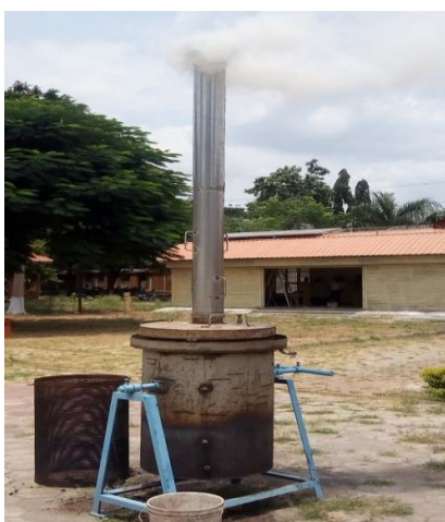
Figure.2 Adsorbent prepared through carbonization process