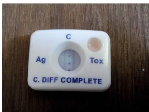
Fig.1 Rapid membrane immune assay (TechLab, USA) for detection of C. difficile and toxins

Figures in parenthesis indicate percentages