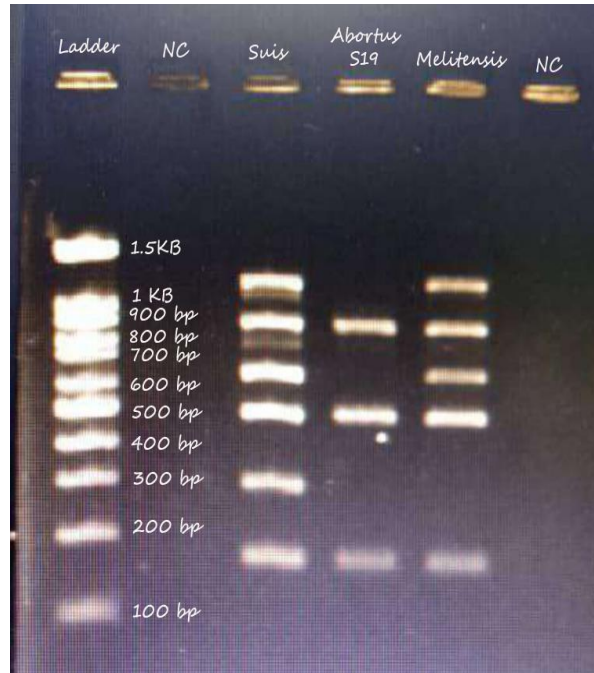
Lane 1- 100bp ladder, Lane 2 negative control, Lane 3 Brucella suis Lane 4 Brucella abortus S19, Lane 4 Brucella melitensis , Lane 5 Negative control