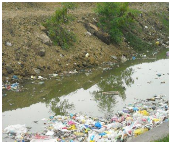
Picture.2 Non degradable plastics

Main problem of plastic mulches are it is non degradable after the use of plastic mulches it form the residue in the field which needs to be removed. If burning the plastic mulch it produces the harmful gas in the air and pollutes the environment and as a land fill it obstruct for infiltration and percolation of water in ground.