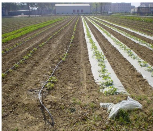
Picture.1 Effect of Plastic Mulching in the Drip Irrigated Vegetable Crop Growth of plants under plastic mulch and in bare soil.

In 1 acre farm 3 times weeding operation is require and in 1 time weeding operation require 4 man days and labour cost is 300₹ per day means total cost 3600₹ is require. So by the use of plastic mulching cost of weeding could be eliminated.