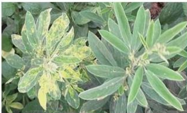
Fig.1 (A) Pigeon pea yellow mosaic symptomatic plant (left) apparently healthy plants (right), (B) Detection of begomovirus by PCR amplification of coat protein region. Lane M-1Kb DNA ladder; Lane D- DNA extracted from PYMD leaf sample; Lane AH1-AH2- DNA extracted from apparently healthy plant leaves