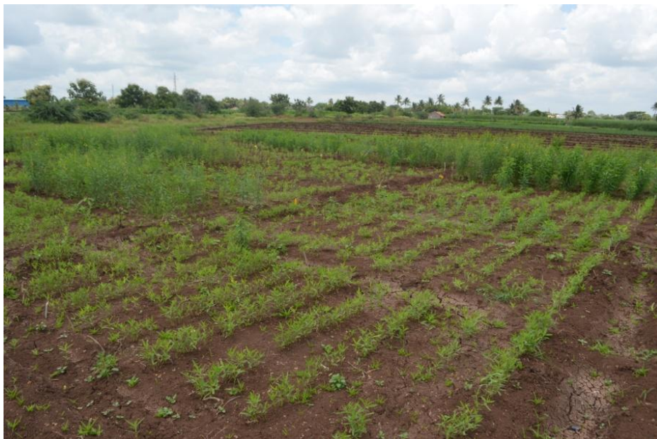
Fig.1 General view of date of sowing of sunnhemp Genotypes

production in D 3 - 1 st fortnight of August. These results are in conformity with the findings of Das et al. , (2014), who had also observed that jute crop sown on 9 th August significantly recorded higher seed yield and dry matter production compared to crop that sown on 25 th July and 24 th August. These results are also in conformity with the findings of Rima and Nabam (2013) for LAI and total dry matter production in cowpea and Yadav (2003) for plant height and number of pods in cowpea. Among genotypes, Local genotype recorded higher plant height and dry matter production (134.0 cm and 98.55 g plant -1 ) compared to SUN-053 (133.1 cm and 97.53 g plant -1 ). This may be due to genetic potentiality of a genotype as it provides optimum growing condition such as temperature, light, humidity and rainfall. Similar findings were reported by Satish et al. , (2006) in dhaincha genotype DH-1 significantly higher seed yield than genotype ND-3 (Fig. 1–3).