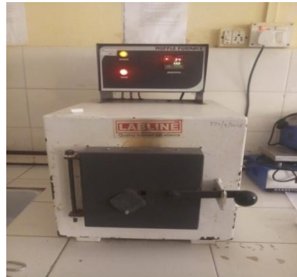
Fig.8 Proximate analysis of briquettes