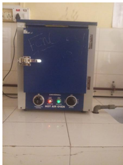
Fig.6 Hot air oven