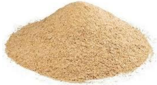
Fig.5 Cow dung