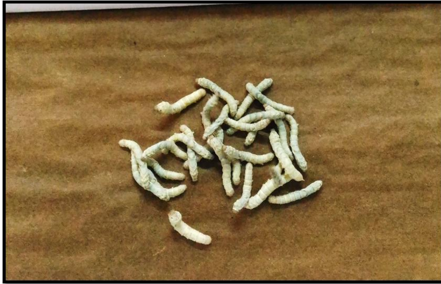
Fig.1 Effect of insecticides on larval mortality (%) in the batches reared on 10 DAS, 20 DAS, 30 DAS and 40 DAS