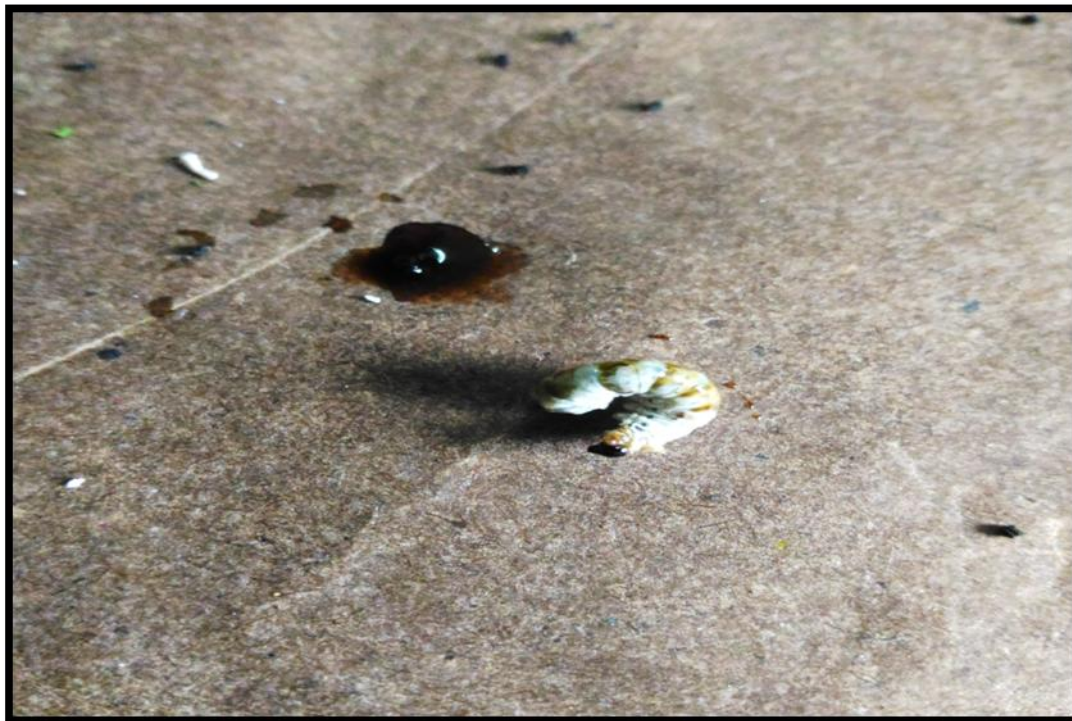
Plate.1 Third instar silkworm larval mortality in the treatment flonicamid 50 WG @ 0.3 g/l

*Significant at 5 %, NS – Non significant, DAS - Days after spraying.