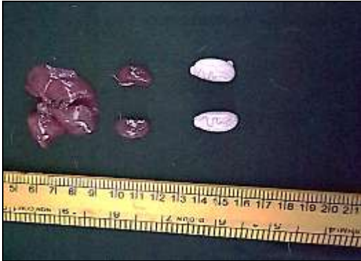
Fig.8 GLP treated rat showing severe congestion of liver, kidneys, testes and marked reduction in the size of kidneys and testicles (Group 2, Day 21)