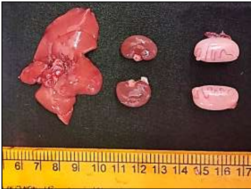
Fig.3 Control rat showing normal appearance of liver, kidneys and testes (Group 1, Day 7)