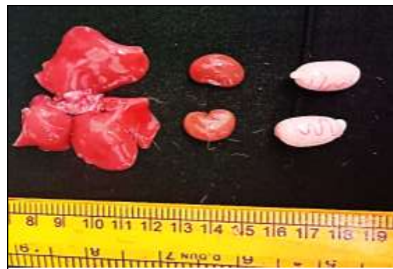
Fig.7 Control rat showing normal appearance of liver, kidneys and testes (Group 1, Day 21)