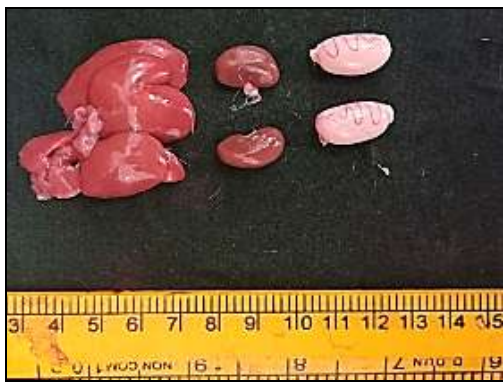
Fig.5 Vitamin C treated rat showing normal appearance of liver, kidneys and testes (Group 3, Day 7)