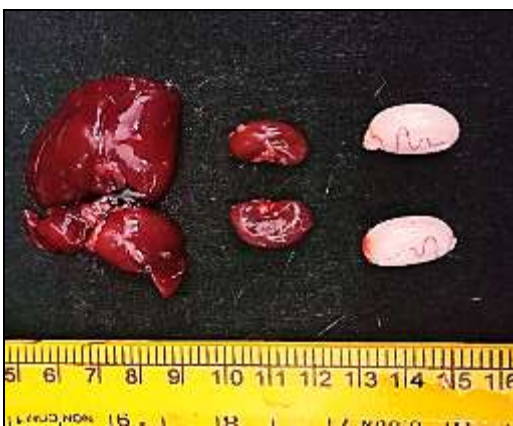
Fig.4 GLP treated rat showing severe congestion of liver, kidneys, decrease in the size of kidneys and marked reduction in the size of testicles (Group 2, Day 7)