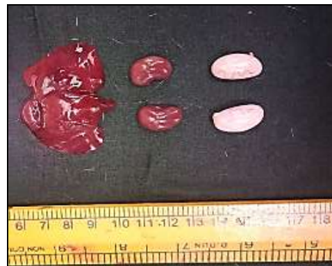
Fig.6 GLP+Vit. C treated rat showing mild congestion of liver, kidneys and moderate reduction in the size of testicles (Group 4, Day 7)