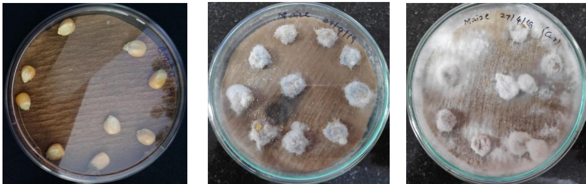
Fig.2 Agar test of local variety showing: 1. Day one seeds on agar 2. Alternaria alternata colony growth after 7 days 3. Fusarium moniliformae colony growth after 7 days 4. Curvularia lunata colony growth after 7 days; 5. Bipolarismaydis colony growth after 7 days

Blotter test Stereo binocular photographs at 10 X