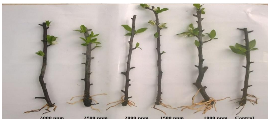
Fig.1 Rooting in different IBA concentrations of 1 st December planted cuttings