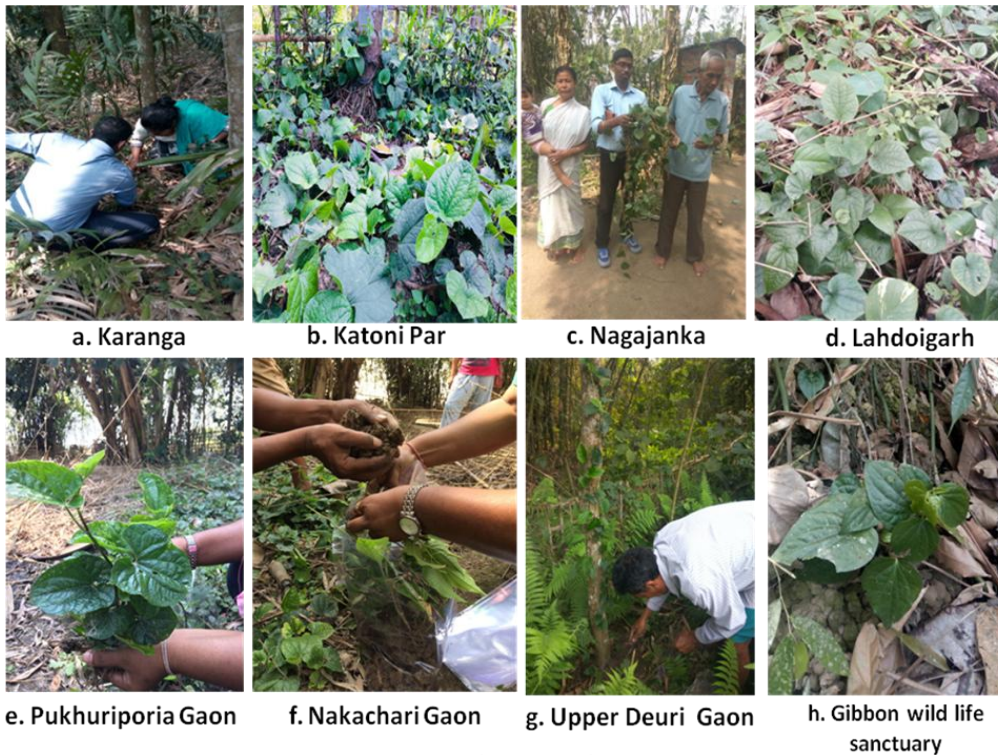
Plate 1. Survey and collection of sample (root , soil) of Pippali plant from different locations of Jorhat district