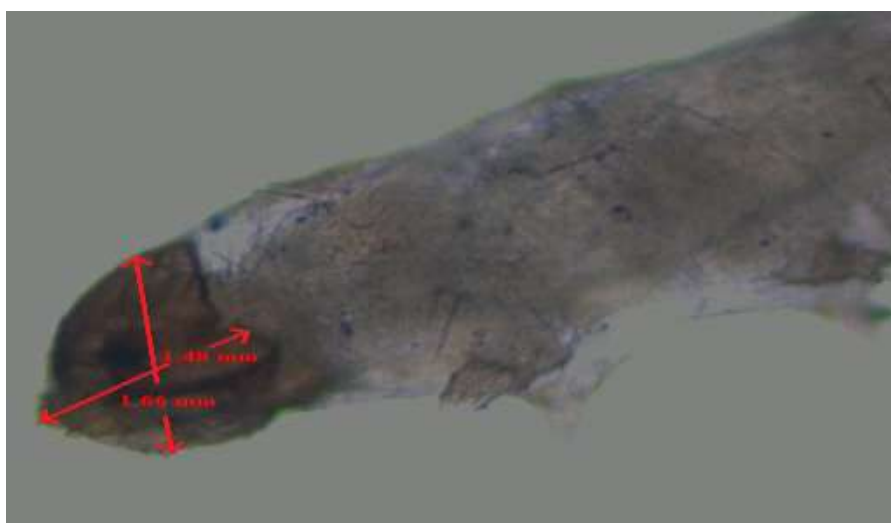
Fig.2&3 Length and breadth of head and Length and breadth of head capsule of capsule II larval instar of III larval instar