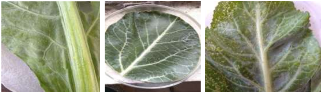
late.4,5&6 III instar & IV instar & Pre-pupae and Pupae